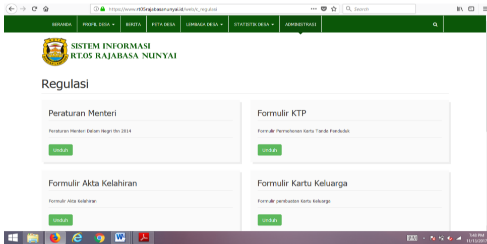
Fig. 5. Views of the website about the regulation of some resident documents