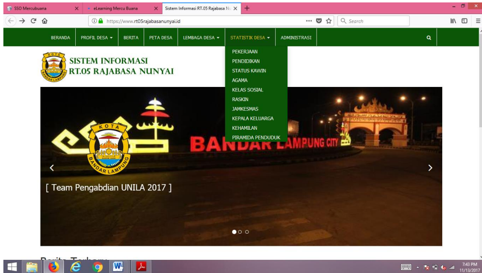
Fig.3. Menu of Village Statistic

The data presented in the form of graphs and tables. For example, Fig. 4 shows the graph of citizen's education data.