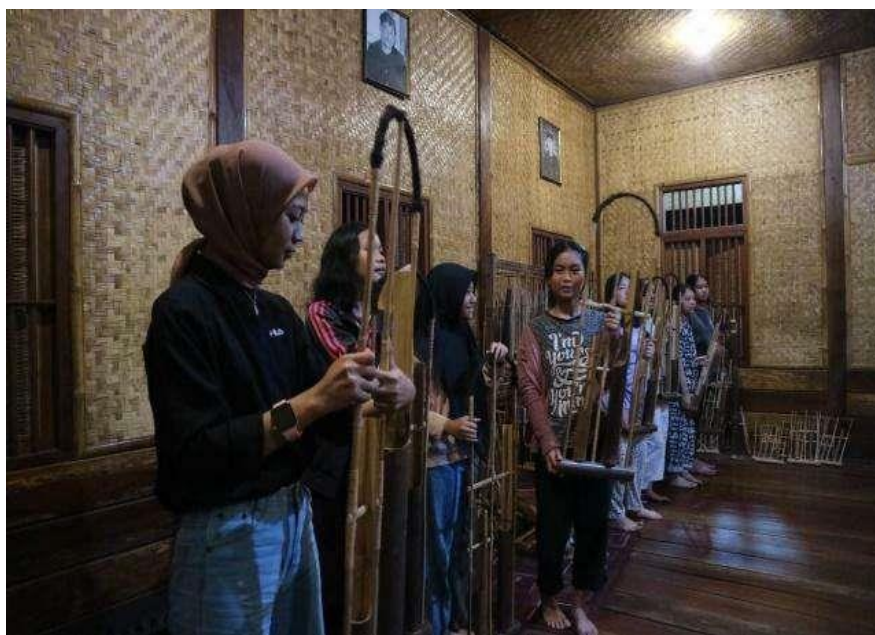
Figure 4. Practicing Angklung Buncis Instruments

However, as time passes, Angklung Beans' functionality continues to evolve and advance. Angklung buncis, which were formerly utilised for spiritual ceremonies, have now been shifted into tourism artworks. The younger generation, unfortunately, did not embrace this development. This is due to many different factors, including internal ones—people no longer value their ancestors' traditions—and external ones—relentless globalization's growth, which has resulted in numerous developments and changes (Baglioni & Chelazzi, 2021). In terms of art, Angklung buncis innovations and modifications are necessary since they are carried out for the purpose of the sustainability of a traditional art. This raises questions about what may be done to preserve traditional arts and promote the Cireundeu community's identity as an indigenous Sundanese people.