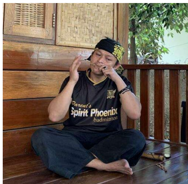
Figure 6. How to play karinding