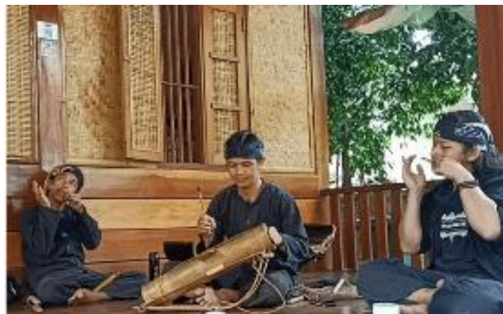
Figure 1. Practicing Karinding Instruments

Angklung buncis and karinding are some of Sundanese artworks that represent the region's native population (Brata & Wijayanti, 2020). One of West Java's traditional music instruments is the karinding. In the socio-cultural context, karinding art is recognised as one of the forms of art that are closely related with location, culture, and nature (Kimung, 2016). This can be seen from the use of bamboo (which is synonymous with nature) as the basic material for its manufacture. This can be seen from the use of bamboo (which is synonymous with nature) as the basic material for its manufacture. The types of pitu bamboo, bombing bamboo, and hair bamboo are typically used as the primary raw materials to create karinding. However, the first karinding was made with palm-type bamboo in ancient times. Despite being made of bamboo, it does not necessarily lessen the aesthetic value of the music that the karinding produces (Nero Sofyan et al., n.d., 2021).