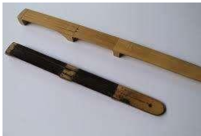
Figure 2. Karinding musical Instrument

The sound of music produced by karinding art is classified as rhythmic music. An accompaniment of melodious voices will always be present throughout a karinding art performance. Functionally, karinding may also be preferred as a musical accompaniment to a variety of genres, where the player's creativity and intellect will determine how it is performed. Karinding reveals a significant philosophical value hidden under its modest appearance. The karinding form is divided up into three components. The second portion is the cecet ucing , in which short and thin karinding bamboo reeds are forced to vibrate and make music when the third part, also known as the paneunggeulan section, is percussed. When the karinding is percussed and brought to the mouth, a constant karinding sound will be produced if the three sections of the karinding are thoroughly mastered by the karinding artist (Kimung, 2016).