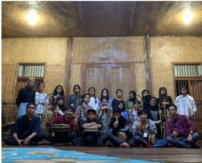
Figure 5. Practicing Karinding Instruments

Despite the fact that karinding is a very ancient musical instrument in and of itself, it is feasible to blend karinding music with that of other, more contemporary instruments. For instance, band performances and karinding musical instruments are frequently collaborated at big events. As of now, it can be inferred that angklung buncis and karinding are two kinds of art which are still maintained and is dearly cherished by the populace despite the current rapidly advancing globalisation era. Additionally, the ritualistic practises of angklung buncis and karinding in the Cireundeu Village are still extremely strong. However, it is important to remember that these practises are also used to preserve the art and culture of the village.