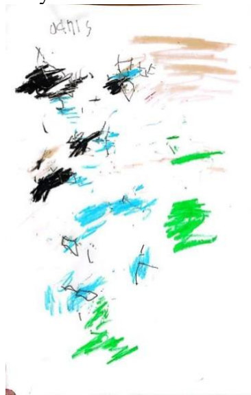
Figure 6. Samples 2 of Disabatural Children Pictures

large, but the coloring carried out by children tends to be untidy and outlines. This is related to the physical condition suffered by the child in the hands.