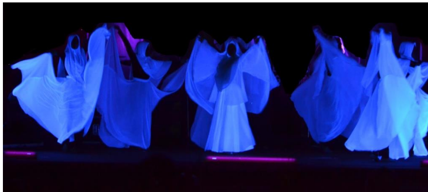
Figure 2. Face Mask Work (doc. Personal 2006)