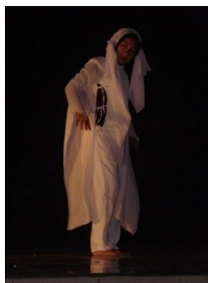
Figure 1. The work of the Light Alleys (doc. Personal 2003)

This work is based on the idea of the existence of the human spirit and how the spirit is connected vertically and horizontally. The researcher tried to interpret the activities of the human spirit in the form of new (contemporary) dance works. The UV light that hits the dancer's body, which is wrapped in white cloth, was the result of the researcher's interpretation of the nonverbal form of the human spirit that becomes verbal, allowing the activity of the human spirit to be seen visually in the form of dance work.