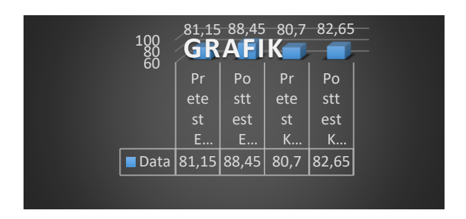
Figure 1. Graph of the Mean Pretest and Posttest Results of the Violin Playing Skills Test

Based on Figure 1, it is known that there is an increase in the scores of violin playing skills in the experimental group and the control group. This is indicated by the mean or average posttest score of violin playing skills which is higher than the mean or average pretest score of violin playing skills in the experimental and control groups. The increase in the average score of violin playing skills in the experimental group was indicated by a score of 7.3, while the increase in the average score of violin playing skills in the control group was indicated by a score of 1.95. Based on this description, it can be concluded that the increase in the average score of violin playing skills was shown by both groups, namely the experimental group and the control group. However, the increase in the average score of the violin playing skills test in the experimental group was higher than that in the control group.