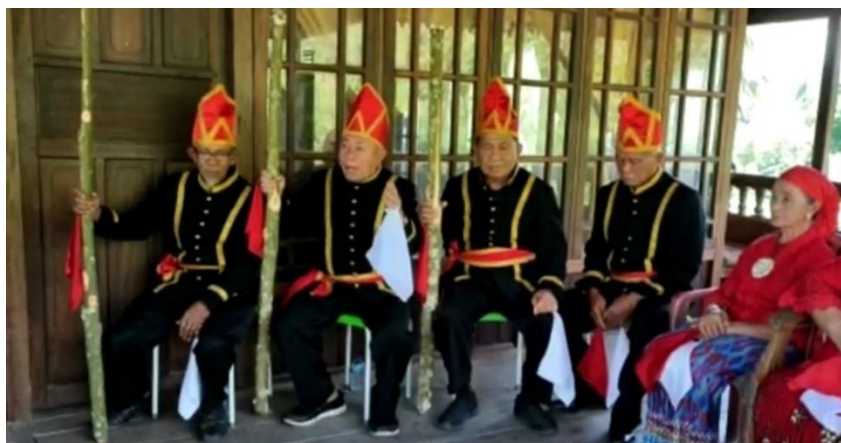
Figure 2. Tagunen singers in Tonsea

In the Minahasa Tradition community, if we talk kolintang, it will mean. First, a Teken or a stick of wood like a stick used by beating to the ground while playing a type of spoken song called Tatembaken. In folk rituals and songs, three signs are usually used. Each is held by three community leaders in Minahasa: Tonaas, Wadian, and Teterusan. Tonaas was the prominent leader in Minahasa society; Wadian functioned as an Imam or spiritual figure who became a liaison between humans and the Opo, while Teterusan functioned as the head of the guard force. These three figures are usually equipped or inherited knowledge that serves to help their communities.