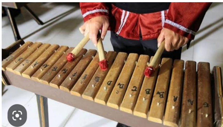
Figure 3. Wooden Kolintang Music Ensemble Accompaniment

Accompaniment is a symbolic form of Wadian/Walian (Makatelu Pitu), Wadian in carrying out rituals and using the number three symbol for ceremonies. This symbolism is still visible in using Kolintang accompaniment wooden sticks totalling seven tools and seven players. Suppose all of them are combined into nine Makarua Siow. This symbol number is a form of adding the Bantik tribal community (Pakasaan Bantik and Siau Pakasaan Bowuntehu Community).