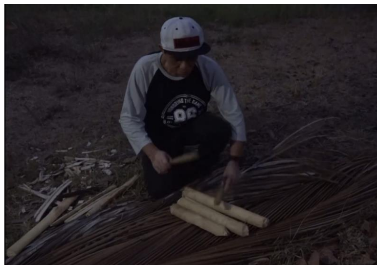
Figure 1. The Triple Wood Kolintang in Waleposan

Like the Minahasa folklore Toar and Lumimuut, they were united in marriage because they found the object of the stick they held; this story symbolises the dualistic opposition phenomenon.