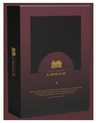
Figure 8. Kubang weaving marketing innovation

From the table above, we can conclude that the business undertaken by the owners of Tenun Kubang Payakumbuh has experienced growth. It is possible that in the future, the business of Tenun Kubang Payakumbuh will continue to thrive, accompanied by improved business management and keeping up with the times. Based on the data and interview results conducted by the author, it can be concluded that the innovative marketing strategies implemented by the Tenun Kubang entrepreneurs have had a positive impact on the sustainability of the Tenun Kubang business. This is significant considering that Tenun Kubang had previously experienced a stagnant period, and with these marketing strategies, the Tenun Kubang business can develop in line with the changing times.