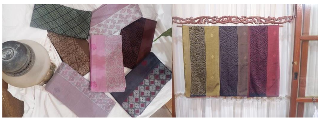
Figure 2. Kubang Woven Cloth

In facing the dynamics of time, innovation becomes the key. Through innovation, Tenun Kubang can acquire new appeal by blending traditional elements with contemporary ones, and presenting works that are captivating and relevant to the needs of the time. In doing so, Tenun Kubang can remain an effective medium in introducing the cultural heritage of Minangkabau to the younger generation and the outside world, while preserving the sustainability of this valuable traditional art. In the context of art, change and fluctuation are natural and necessary for art to thrive and evolve. With new challenges and issues emerging, artists and weavers of Tenun Kubang must continually seek creative and innovative solutions to ensure the continuity of this traditional art, while also presenting representations that align with the needs and demands of the time.