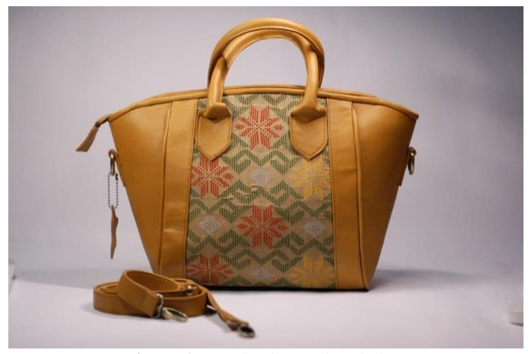
Figure 6. Weaving innovations in bags

Available online: https://jurnal.unimed.ac.id/2012/index.php/GDG