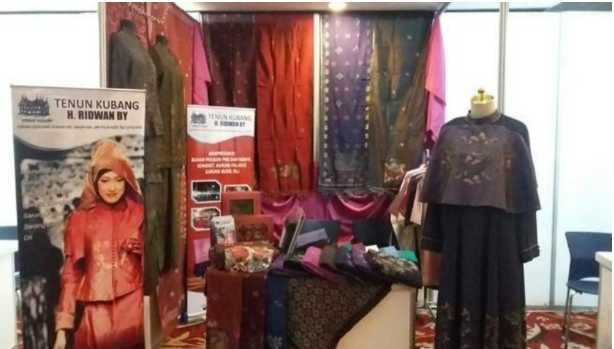
Figure 9. National and International Exhibitions as a Form of Marketing for Kubang Weaving