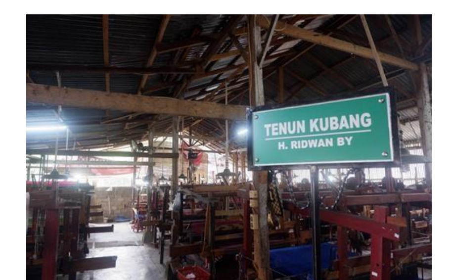
Figure 1. Kubang Weaving Location