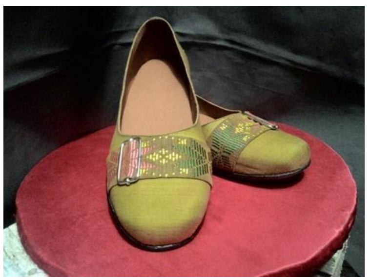
Figure 7. Weaving Innovations in Shoes