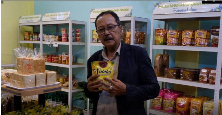
Figure 2. Interview Process

conceptual message to the audience. Taking pictures from various angles can provide a clear picture of the product and the message you want to convey in the promotional video. Shooting outdoors can be done in the morning and evening to get ideal lighting.