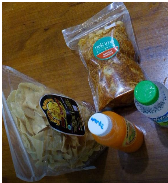
Figure 3. Several Products Sold at Alfath Mart

The use of models in promotional videos is quite influential in being attractive in promotional videos, however, model selection needs to be paid attention to so that the model chosen can embody the role to the maximum. Using the right tools and applications when making promotional videos has more or less an impact on the quality of the resulting video, skill in operating the tools and applications also influences the video results. The right publication media is adjusted to the target market for the product being promoted, then the publication time needs to be paid attention to so that the promotional video can be published at the right time.