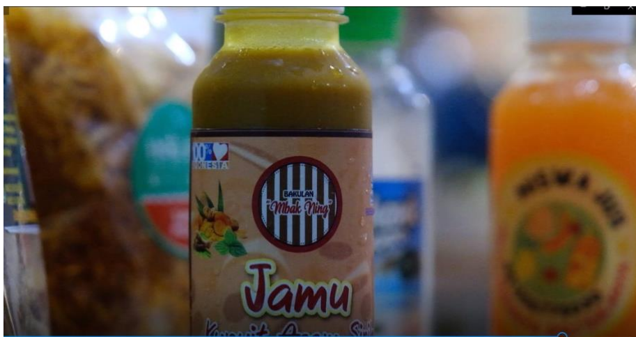
Figure 4. One Of The Product Shots

Shooting is done by referring to the concept that has been created and outlined in the storyline and storyboard. Shooting is done in the shop room, so it needs to be supported by good lighting to get sufficient lighting. In producing promotional videos, the author and team apply the principles of mise en scene which consist of lighting, setting up the background, and controlling the movements of the players. Apart from that, to get an interesting arrangement of images, the team took short shots combined with camera movements while paying attention to the continuity between shots, this technique is called the B-Roll technique. Shooting for this promotional video is dominated by Close-Up (CU) shooting techniques where the aim is to provide cinematic emphasis on the video. The effect of taking pictures using the CU technique will produce images with a bokeh background. Moreover, if we consider the purpose of making a video as a product promotion, the emphasis is on strengthening the object so that the point of interest presented is very clear and able to arouse appetite. The background settings were carried out by the UMKM owners and emphasized natural effects. Several food products sold at UMKM Alfath Mart are arranged neatly and the arrangement also conforms to the principle of balance.