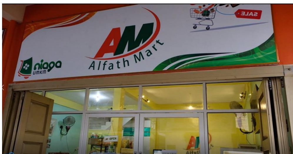
Figure 5. UMKM Promoted Via Video

The mixing process will connect video with audio and text. The first step is mixing by importing all the files needed in Adobe Premiere, then dragging the audio in the work space. Place it in the work space and place it in a place that suits the duration of the desired video. Then add text to support the video. The first step to export a video is to select the file menu then export then media, then on the export settings sheet select best quality, frame rate 25fps, then select the H.264 format with 1 pass VBR encoding bitrate, then check the audio output. on the output sheet to set the video file storage location. Then click the export button at the bottom right. After exporting we have to screening video. In this process, the advertising video will undergo a screening test with videography experts, Alfath Mart shop owners and Alfath Mart consumers before being forwarded to the distribution process. The last step is, distribution. All processes have been completed and reviewed carefully, so this advertising video will then be continued in the distribution process, namely by uploading the advertising video on Alfath Mart's special website and application, namely www.niagaumkm.com as a promotional medium for marketing Alfath Mart products.