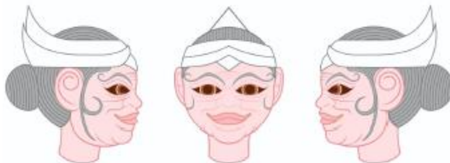
Figure 1. Design model of the shape of a wayang golek puppet head character wearing a headband (Doc. Radi Arwinda, 2024)