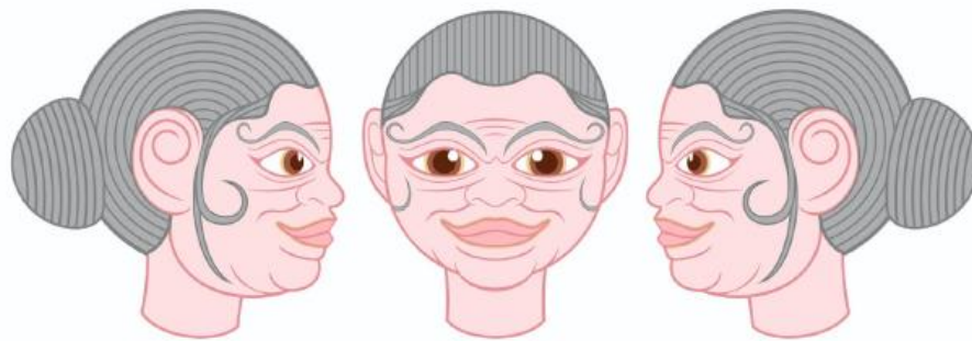
Figure 4. Alternative head designs for wayang golek characters that are desired to build a story with a separate warrior headband. (dok. Radi Arwinda, 2024)

character. Additionally, the cream-colored wrinkles were preserved to retain a sense of age and wisdom, while the white cloth bracelet was matched to the headband, enhancing the overall harmony of the design. This combination was intended to imbue the puppet with a heroic impression reminiscent of the Wiro Sableng warrior while still referencing the elegance of wayang putri . Based on these suggestions and revisions, alternative designs were proposed to better align with the envisioned character narrative and thematic elements.