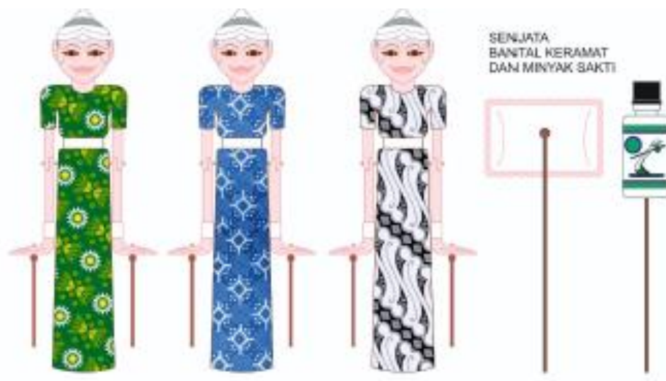
Figure 2. Design model of the body shape of a wayang golek puppet character using batik motifs.