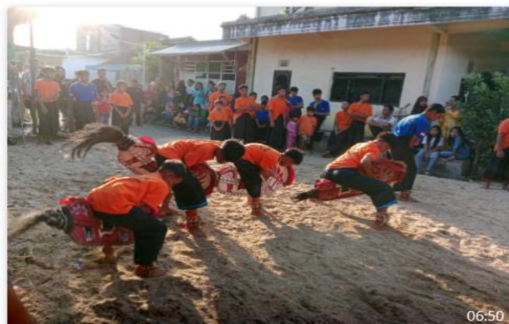
Figure 2. Joint Practice of Peer Groups in Games With Adult Groups (Doc. Suprihatin, 2024)

The instructor and trainer direct them to do it in the two ways above. This is done to strengthen the absorption of cultural and aesthetic values from Jaranan. It should be conveyed that the presentation of jaranan in Tumpang follows the presentation of Gaya Dor and has the same sequence structure, namely, first Kembangan 1, Kembangan 2 and kalapan. The musical instruments played are also the same: kendang, Jidor, and angklung. The songs performed include songs: cat ireng, wendit Wisata (WARA, 2021). Some of the movements performed in Jaranan Gaya Dor Tumpang have many similarities. If there are differences, they are not too significant because the emphasis is on the strength of the legs, which follows the drumming pattern and the fall of the jidor. The following is the training conducted in the Satrio Bokor Group.