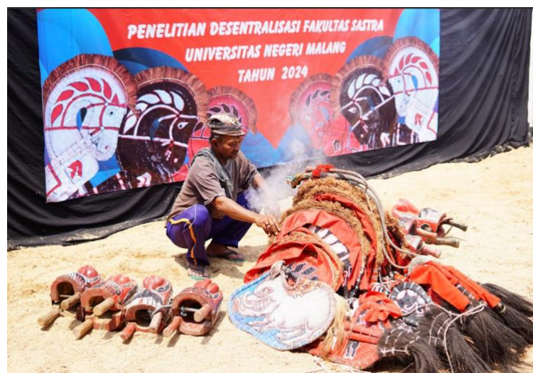
Figure 3. Ujub Donga (Doc. Suprihatin, 2024)

An introduction of the importance of praying to God Almighty and also the ancestors in the Bokor Tumpang area is also done before the event begins. This prayer session, or ujub donga , is an introduction to the culture of respecting and appreciating the Almighty and the ruler of the area who is considered to have a role for the village at that time. The prayer ritual is always done before the performance begins, accompanied by the burning of incense. The chanting of prayers begins to be said by the elders or elders of Satrio Bokor. The red, black and white colours that are characteristic of Jaranan Dor Tumpang, including the Satrio Bokor group, are also applied to the properties used, namely black, red and white as follows.