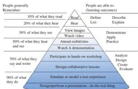
Figure 1. Dale's cone of experience

The base theory of media that use in learning process by Dale's cone of experience (1946;Davis et al.,2015:2; Buhun et al.,2019:145) is: