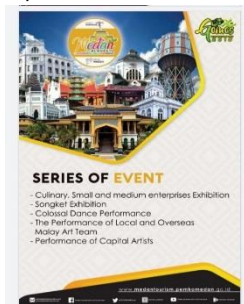
Data Sources: Research Results, 2020

Based on the brochure "Purpose and Objectives" , educational persuasion sentences in this study are contained in the "Education" indicator. Education here is a form of explanation to the public that the GeMeS event is also intended as a medium of education, especially for the current generation. Where there have been a lot of foreign cultures that have influenced the younger generation. With the presence of a typical Malay arts and culture event, the Medan City Tourism Office hopes that in the future the younger generation will be able to recognize, preserve and develop Malay culture as a culture that has unique characteristics, various kinds of songket cloth, language, customs, religions, and others.