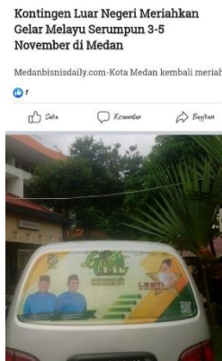
Data Sources: Research Results, 2020

Malay culture has its characteristics and attractions for tourists who visit Medan city. It has also been explained here that this event was held to attract tourists and introduce Malay cultural heritage to the public. This is done because the Malay culture has unique characteristics that can attract tourists to visit. Then, still with the "Purpose and Objectives" brochure, the persuasion paragraph of advertising can also be seen in the "Contact Us" indicator, where this indicator explains to find out complete information related to the GeMeS event being held, so contingents from abroad can find out more detailed information with contact the contact listed.