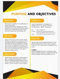
Data Sources: Research Results, 2020

The "Participant" brochure explains that the 2019 GeMeS event promotion advertisement also describes which regions, provinces, and countries have participated in previous years. It should be noted that the main targets of the GeMeS Event in 2019 this time are India and Korea. Because from 2017-2018 countries such as Malaysia, Singapore, Brunei Darussalam, and Thailand have participated in the GeMeS event. However, at the time of sending the invitation letter, India and Korea had not responded well.