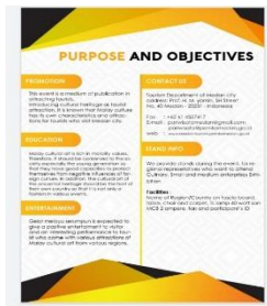
Data Sources: Research Results, 2020

Based on the brochure "Purpose and Objectives" , educational persuasion sentences in this study are contained in the "Education" indicator. Education here is a form of explanation to the public that the GeMeS event is also intended as a medium of education, especially for the current generation. Where there have been a lot of foreign cultures that have influenced the younger generation. With the presence of a typical Malay arts and culture event, the Medan City Tourism Office hopes that in the future the younger generation will be able to recognize, preserve and develop Malay culture as a culture that has unique characteristics, various kinds of songket cloth, language, customs, religions, and others.