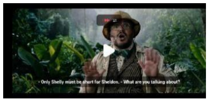
Data 2: (00:20:19)

c) Meaning of gesture in cultural context: In United States and Western European Culture, pointing with the index finger is more common and accepted in everyday contexts. However, pointing directly at another person can still come across as a rude or disrespectful depending on the situation.