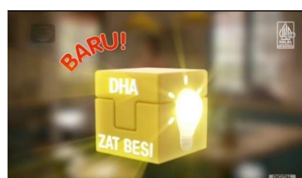
Image 6. Dancow Fortigro Coklat Ad