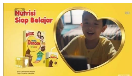
Image 4. Dancow Fortigro Coklat Ad

The dominant color in both advertisements is yellow, which is bright and vibrant. Yellow is often associated with positivity, energy, warmth, and happiness. While the red text “Nutrisi Sama, Harga Baru. Lebih Murah!” and “Nutrisi Siap Belajar” adds urgency and draws attention to key promotional messages. In the Dancow 1+ Imunutri advertisement, yellow highlights affordability and complements the playful interactions between a mom and her child. Similar but not the same, the color yellow in Dancow Fortigro Coklat advertisement conveys enthusiasm and energy.