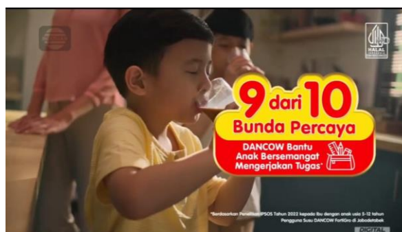
Image 7. Dancow Fortigro Coklat Ad

The scientific elements in both advertisements are highlighted through the depiction of DHA and iron as interlocking puzzle pieces that complement each other. This illustration emphasizes the key nutrients for children’s growth and cognitive development. DHA (Docosahexaenoic Acid) is widely recognized for its role in brain health and function, particularly in supporting memory and learning, while iron helps in oxygen transport in overall energy levels. This adds the credibility and appeals to the targeted audience.