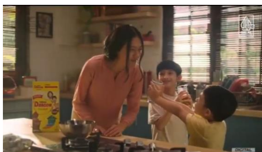
Image 2. Dancow Fortigro Coklat Ad

Meanwhile, the Dancow Fortigro Coklat advertisement was set in a cozy kitchen, where the mother shares a joyful moment with her two energetic children. Their laughter fill the room as they enjoy their drinks. The scene feels relatable, showing how Dancow supports not just physical growth, but also the happiness and vitality of children.