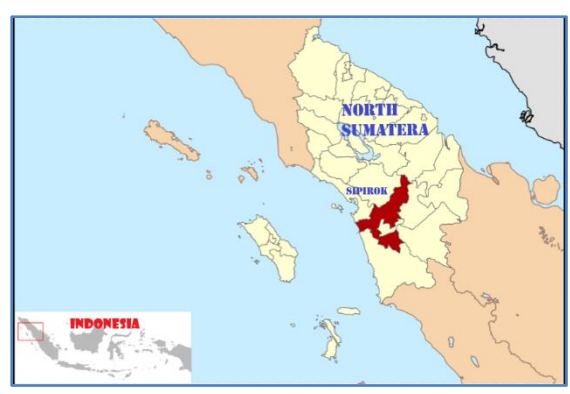
Figure 1. Research locus of Darul Mursyid Boarding School located in the Sipirok district area, North Sumatera - Indonesia