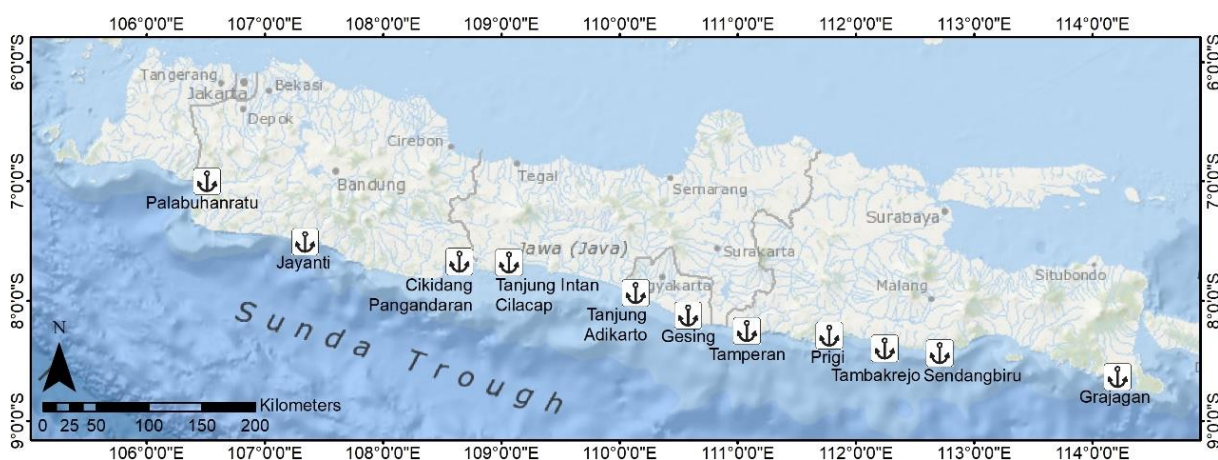
Figure 1. An example of a fishing port in southern Java

Adequate data and information on tidal characteristics will assist the government and the community in planning and developing coastal areas (Syahputra and Nugraha, 2016; Hamuna et al., 2018; Fitriana et al., 2019). Regarding tide monitoring, Presidential Regulation Number 93 of 2019, concerning Strengthening and Development of Earthquake Information Systems and Tsunami Early Warning, states that the Geospatial Information Agency (BIG) is tasked with carrying out the construction and operation of equipment for earthquake observation and tsunami, including carrying out maintenance of the equipment. The equipment is a Continuous Global Positioning System, a Continuously Observation Reference Station (CORS), and a Tide Gauge (Government of Indonesia, 2019).