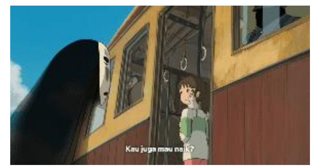
Figure 9. Kaonashi's Size Returns to Normal and Followed Chihiro

Chihiro has left the bathing building, at the same time as Kaonashi has ended up returning to his initial form which looks limp and can only say " ah.. ", Chihiro continues to lure Kaonashi away from the bathing area, because Chihiro already knows that Kaonashi is dangerous if he stays still at bathing area.