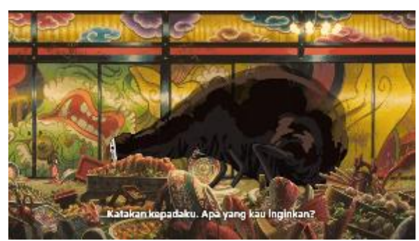
Figure 7. Kaonashi Tries to Get Chihiro

The next Kaonashi scene is when Chihiro is called by the boss of the bathhouse named Yubaba, the boss of the bathhouse, calling Chihiro to take responsibility for Kaonashi's dangerous entry into the bathhouse. Kaonashi gets bigger and snaps at all the workers, including Yubaba. He just wanted to meet Chihiro. When Chihiro was reunited with Kaonashi, Kaonashi offered Chihiro lots of food and gold, "try eating this, it's delicious", "or do you want gold? I decided just for you", "come here", "what do you want?" with Kaonashi's voice changing like different people taking turns.