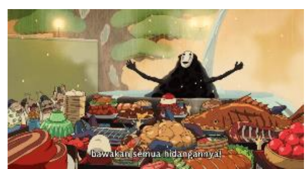
Figure 6. Kaonashi Gives a Lot of Gold

Kaonashi also did the same thing to Chihiro when Chihiro accidentally met Kaonashi whose body size was already bigger than before, Kaonashi offered her more gold than anyone else, but Chihiro rejected him again "don't want to, don't need to" and Chihiro immediately left politely but seemed to be in a hurry when all the workers were focused on picking up the pile of gold which had fallen from Kaonashi's hands, who was again disappointed because of Chihiro's refusal. When all the workers were busy picking up the gold, Kaonashi in the end immediately swallowed the two workers in in front of the other workers and makes everyone run around in panic because they just found out that Kaonashi can swallow people.