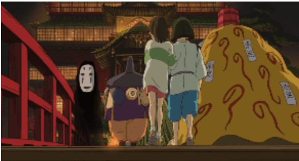
Figure 2. Chihiro Meets Kaonashi (Source: Spirited Away Animated Film, 2001)

Kaonashi first appeared when Chihiro was trapped in the spirit world and working in a spirit bath. Both of her parents have been turned into Pigs, and Chihiro must find a way to return to the human world with them. Kaonashi is depicted as having a semi-transparent body and wearing an expressionless mask that can change. He just stood quietly in the middle of the bridge, different from the other spirits heading towards the baths. Kaonashi couldn't speak, only making soft "ah? ah..." sounds. A few days later, when Chihiro opened the door to throw away the water used for mopping, Kaonashi was still standing outside looking at her. Chihiro opened the door to the bathing room so Kaonashi could enter to take shelter. Chihiro considers all spirits to be guests who must be treated well.