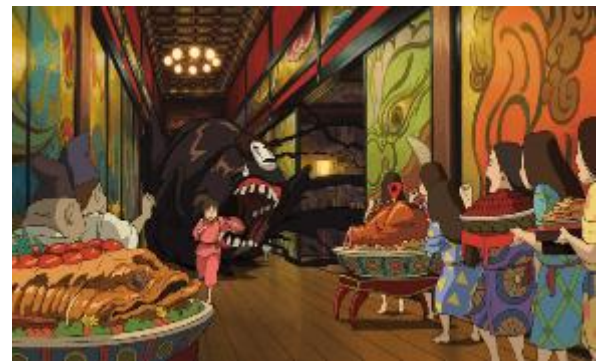
Figure 8. Kaonashi Chasing Chihiro (Source: Spirited Away Animated Film, 2001)

night, Kaonashi didn't know what Chihiro had just given him, making Kaonashi angry at Chihiro and chasing her out of the room, the scene became a chase between Chihiro and Kaonashi, Chihiro continuing to run from the top floor to the bottom floor, Kaonashi who was continuously chasing Chihiro also gradually started to reduce his body size because he kept vomiting while chasing, to the point where Kaonashi vomited several bathhouse workers that Kaonashi had initially swallowed, it turned out that these workers were still alive all this time inside Kaonashi's stomach.