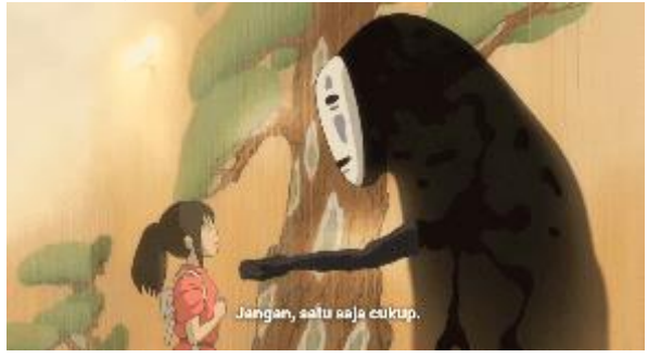
Figure 3. Chihiro Rejects Kaonashi's Labeling (Source: Spirited Away Animated Film, 2001)

While Chihiro was doing her other task, Kaonashi suddenly appeared slowly, who started out invisible, gradually became visible, giving her a herbal label for her work needs that Chihiro actually needed. Chihiro also thanked Kaonashi because initially Chihiro was not given the label by the foreman who took care of all the labels for the bathing water. When Chihiro had taken care of the labels to release the herbal bathing water in the large bathtub, Kaonashi appeared again near Chihiro, this time Kaonashi turned out to be carrying a lot of labels in his small hands for Chihiro, but Chihiro had got it earlier, she only needed one, so Chihiro rejected it by saying "I don't need that much" , " No, just one is enough" .