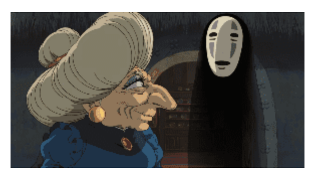
Figure 10. Kaonashi Lives with Zeniba (Source: Spirited Away Animated Film, 2001)