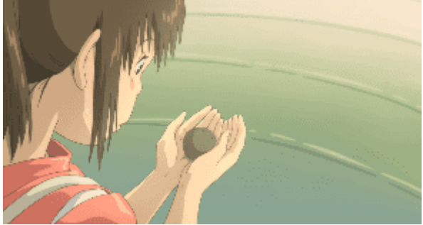
Figure 4. Chihiro Gets Herbal Medicine (Source: Spirited Away Animated Film, 2001)

Then Kaonashi sounded disappointed with his voice and disappeared again, the labels fell to the floor, until Chihiro finished her first job serving one of the spirits who turned out to be a famous river god and caused an uproar in the bathhouse because the river god paid the bathhouse with lots of scattered gold and also secretly gave Chihiro a herbal medicine for her. Chihiro thought the herbs could turn her parents back into humans again.