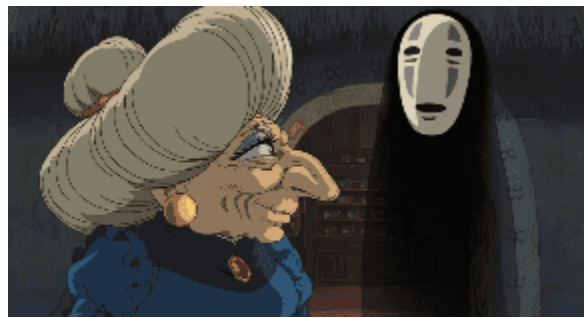
Figure 10. Kaonashi Lives with Zeniba (Source: Spirited Away Animated Film, 2001)

In the first scene, Chihiro meets Kaonashi (in figure 2) which looks like a (sign). Kaonashi always kept quiet, didn't move or walk, just turned his head slowly at what he wanted to see, and didn't express anything. Projections of surrounding objects show that no one sees Kaonashi, such as when Chihiro and Haku walk on a bridge full of other spirits. The meaning (interpretant) seen in this scene is that no one cares about Kaonashi's existence, even though in fact everyone there can see him. Kaonashi was ignored by all the residents there, and only Chihiro who greeted Kaonashi.