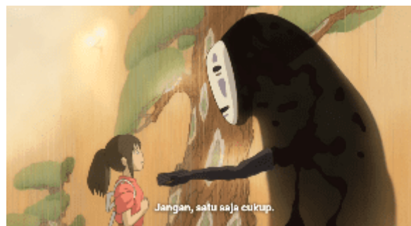
Figure 3. Chihiro Rejects Kaonashi's Labeling (Source: Spirited Away Animated Film, 2001)

While Chihiro was doing her other task, Kaonashi suddenly appeared slowly, who started out invisible, gradually became visible, giving her a herbal label for her work needs that Chihiro actually needed. Chihiro also thanked Kaonashi because initially Chihiro was not given the label by the foreman who took care of all the labels for the bathing water. When Chihiro had taken care of the labels to release the herbal bathing water in the large bathtub, Kaonashi appeared again near Chihiro, this time Kaonashi turned out to be carrying a lot of labels in his small hands for Chihiro, but Chihiro had got it earlier, she only needed one, so Chihiro rejected it by saying "I don't need that much", "No, just one is enough".