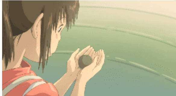
Figure 4. Chihiro Gets Herbal Medicine (Source: Spirited Away Animated Film, 2001)

Then Kaonashi sounded disappointed with his voice and disappeared again, the labels fell to the floor, until Chihiro finished her first job serving one of the spirits who turned out to be a famous river god and caused an uproar in the bathhouse because the river god paid the bathhouse with lots of scattered gold and also secretly gave Chihiro a herbal medicine for her. Chihiro thought the herbs could turn her parents back into humans again.