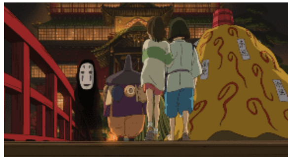
Figure 2. Chihiro Meets Kaonashi (Source: Spirited Away Animated Film, 2001)

Kaonashi first appeared when Chihiro was trapped in the spirit world and working in a spirit bath. Both of her parents have been turned into Pigs, and Chihiro must find a way to return to the human world with them. Kaonashi is depicted as having a semi-transparent body and wearing an expressionless mask that can change. He just stood quietly in the middle of the bridge, different from the other spirits heading towards the baths. Kaonashi couldn't speak, only making soft "ah? ah..." sounds. A few days later, when Chihiro opened the door to throw away the water used for mopping, Kaonashi was still standing outside looking at her. Chihiro opened the door to the bathing room so Kaonashi could enter to take shelter. Chihiro considers all spirits to be guests who must be treated well.