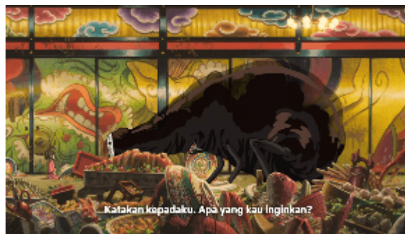
Figure 7. Kaonashi Tries to Get Chihiro

The next Kaonashi scene is when Chihiro is called by the boss of the bathhouse named Yubaba, the boss of the bathhouse, calling Chihiro to take responsibility for Kaonashi's dangerous entry into the bathhouse. Kaonashi gets bigger and snaps at all the workers, including Yubaba. He just wanted to meet Chihiro. When Chihiro was reunited with Kaonashi, Kaonashi offered Chihiro lots of food and gold, "try eating this, it's delicious" , "or do you want gold? I decided just for you" , "come here" , "what do you want?" with Kaonashi's voice changing like different people taking turns.