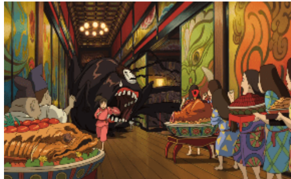
Figure 8. Kaonashi Chasing Chihiro (Source: Spirited Away Animated Film, 2001)

room, the scene became a chase between Chihiro and Kaonashi, Chihiro continuing to run from the top floor to the bottom floor, Kaonashi who was continuously chasing Chihiro also gradually started to reduce his body size because he kept vomiting while chasing, to the point where Kaonashi vomited several bathhouse workers that Kaonashi had initially swallowed, it turned out that these workers were still alive all this time inside Kaonashi's stomach.