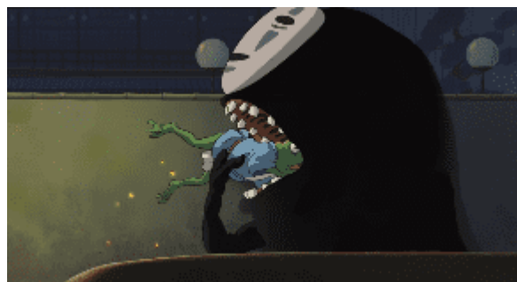
Figure 5. Kaonashi Eats the Bathhouse Guard (Source: Spirited Away Animated Film, 2001)

After the bath closed and all the workers were sleeping, it turned out that Kaonashi was still wandering around in the bath, was caught by one of the guards at the bath, asked Kaonashi to immediately leave the bath because there should be no more guests, but from Kaonashi's hand slowly a little gold appeared little by little, and dropped it on the floor, the guard was shocked and took the gold, Kaonashi again took out more gold from his hand and let the guard take it from Kaonashi's hand, which turned out to be when the guard took the gold from Kaonashi's hand, Kaonashi's fingers suddenly became very long and entangled the guard and immediately swallowed him whole.