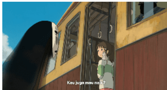
Figure 9. Kaonashi's Size Returns to Normal and Followed Chihiro

Chihiro has left the bathing building, at the same time as Kaonashi has ended up returning to his initial form which looks limp and can only say "ah..", Chihiro continues to lure Kaonashi away from the bathing area, because Chihiro already knows that Kaonashi is dangerous if he stays still at bathing area.