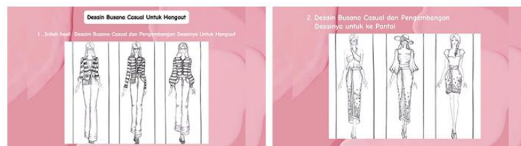
Figure 3. Video ending section

In the last part of the video, the video is shown as it is being played, which is a simple animation with instruments accompanied by musical instruments and text, image and text transition effects. AI voice which consists of casual fashion design results and their development for hangout to the beach and thanks from the researchers.