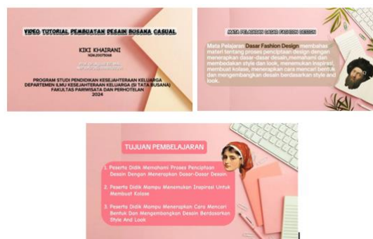
Figure 1. Opening part of the video

The initial appearance of the video when it is played is a simple animation accompanied by instruments. musical instruments and text, image and transition effects AI voice which can attract students' attention, which consists of several slides namely of university institution, brief identity of researcher, definition of basic subjects fashion design, displays the learning objectives of basic subjects fashion design.