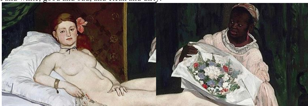
Figure 6. Black and White Female Shape Idea in “Olympia” Painting

Given that one of the key things that people found offensive about Manet's painting in his day was the look in Olympia's eyes, not her nudity or her maid. The painting contains several visual elements in the form of bracelets, pearl earrings, and an oriental shawl on the place where Olympia is lying, all of which symbolize women's wealth and sensuality. In the view of radical feminism, the idea of these forms is something that greatly restricts women in gaining their right to freedom. It is as if women are not given the right to be equal to men or even the right to surpass the masculinity of men. Edouard Manet's “Olympia” was used in the 1970s as a major and important reference in the context of the male gaze promoted by feminism. Black feminist women argue that Manet did not incorporate the idea of the maid form for artistic purposes, but rather to create an overall idea of black and white, good and bad, and clean and dirty.