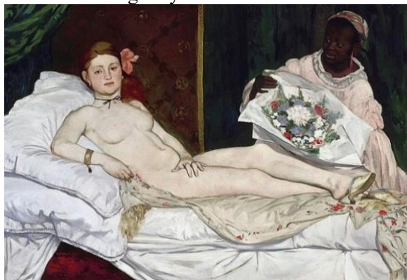
Figure 5. Symbol of Wealth Shape Idea in “Olympia” Painting

is a gender critique of the traditional art of her time. Women could only be enjoyed for their nudity and it was not a serious problem when the nude female figure was depicted on the incarnation of goddesses and even angels. Such erotic depictions were considered honorable and did not violate the prevailing rules and norms, which of course were deliberately made for the purpose of admiring and even respecting the object, not respecting the subject. Another interpretation comes from scholars who suggest that the woman was looking at the door, as her client arrived unannounced. On the other hand, the depiction of Olympia's behavior represents courage by ignoring the flowers that are interpreted as a gift from the client brought by her maid.