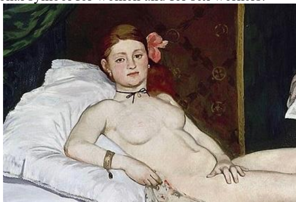
Figure 3. Olympia's Gaze Shape Idea in “Olympia” Painting

Basically, Manet's “Olympia” painting is meant to emphasize and underline her sexual and economic independence from men. Another difference is the visual element in the form of an animal, instead of presenting a visualization of a dog, Manet painted a visualization of the idea of a black cat that interprets the traditional symbol for women and for sex workers.