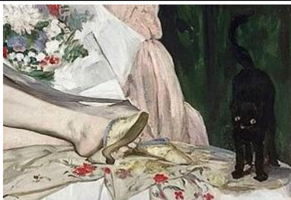
Figure 2. Cat Shape Idea in “Olympia” Painting