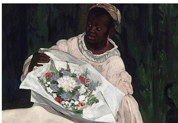
Figure 4. Flower Carried by the Maid Shape Idea in “Olympia” Painting