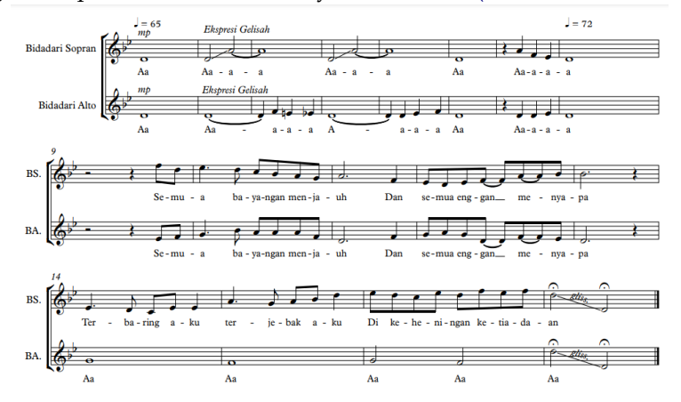
Figure 2. Melody arrangement depicting a restless atmosphere

diatonic instrument (combo) is also necessary in order to create a unified sound results with each other. About it is considered to arise a good impression when heard by the audience (Heldisari & Astuti, 2018).