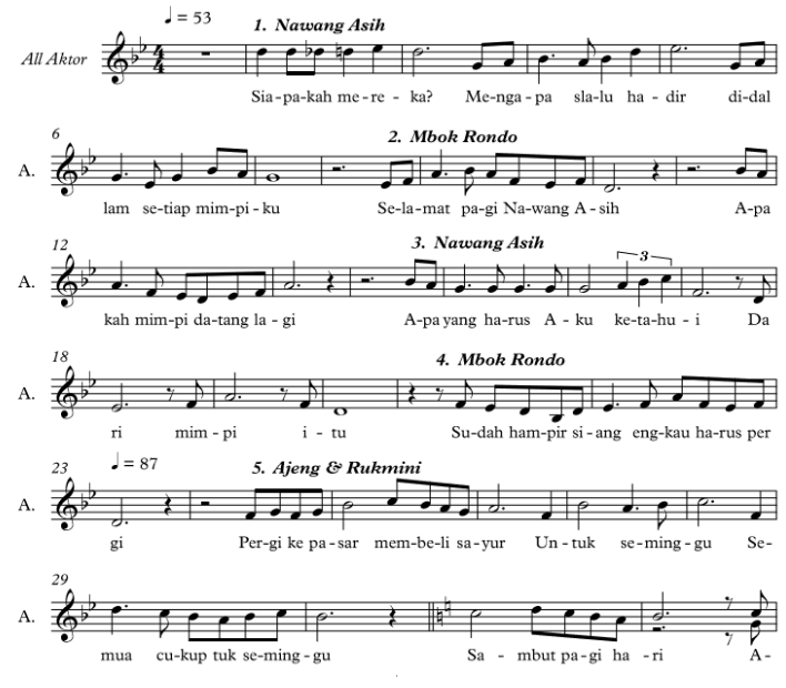
Figure 4. Tempo change from 53 to 87

Scene 3 uses a larghetto (slow) tempo of 60 bpm (beat per minute) because it depicts Nawang Asih insisting that he really wants to know who and where his mother is. The use of a predominantly slow tempo illustrates that the story is telling sadness. The main character, Nawang Asih, sings a dominant song describing feelings of sadness so that it is supported by sad expressions. Interpretation in music, especially vocals, is a passion for songs that is interpreted in oneself through the expression as requested by the composer and the development of oneself (Utama dkk., 2020). Therefore, to play a piece of music well, it is necessary to understand the composer's work well so that interpretation needs to be carried out, so that the composer's message can be conveyed to the audience. Interpretation is closely related to chemistry, especially the performer or singer with the composer and then conveyed to the listener.