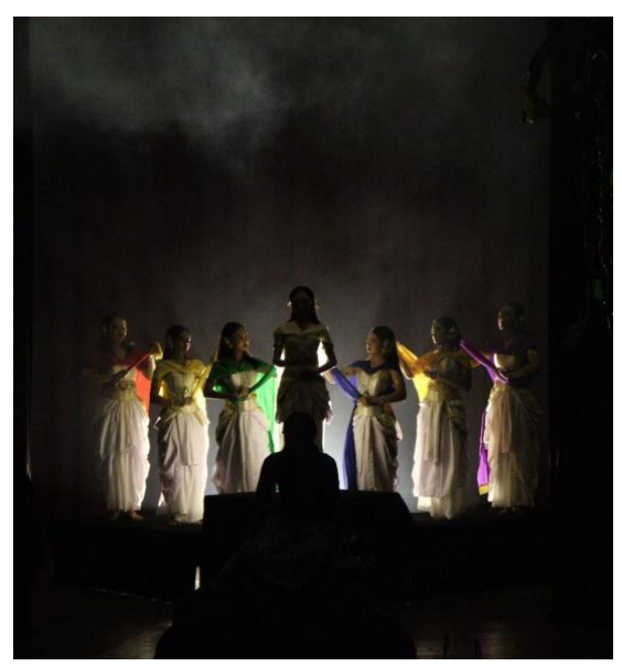
Figure 1. Illustration of an angel descending to earth

The learning outcomes of musical dramas in terms of cultivation, rehearsal process, and accountability of works are quite good and satisfying. Students are increasingly trained to think critically and logically, as well as hone creativity because they are not allowed to take actors from outside the group that has been determined so that the casting that has been done is casting in the group. This certainly makes students rack their brains to adjust the skills or abilities of their group members to the needs of the musical itself.