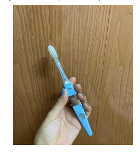
Figure 2: Taken by GF in Bangkok, Thailand

This student also gives the picture an expression in Photovoice while studying from a distance with DingTalk App.