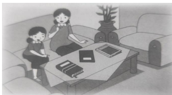
Figure 4. 3 A Mother With Her Daughter (Source: English on sky 2 for grade VIII)

This picture was taken on page 70. This picture shows a teacher teaching several students in the classroom, in that room there are tables and chairs and also 3 windows can be seen on the left side. This picture belongs to the second type of feminism "women's obligation to her self. This type has the understanding that a woman has the right to work whatever she needs. The reason this picture is categorized into type number 2 is because working as a teacher may be considered necessary by some people because people feel the need to share knowledge and then also become a teacher to help these women add to the economy for their needs. The reason women are represented like that picture is because women have multiple roles. So this picture is categorized into the public role because they can make money by teaching.