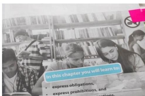
Figure 4. 4 3 Girls in The Library

This picture was taken on page 7. In the picture can be seen a mother sitting on the sofa and talking to her daughter, beside the mother there are a jar and a plant while in front of them there are books placed on the table. This image belongs to the category of the third type of feminism "Women's obligation to her family". This picture is categorized into the third type because women have a duty to teach their children at home. Therefore the reason this image is represented in the book is to show that there are multiple roles being played by women, namely the domestic role. This pictures is also categorized into the type of domestic role because housewives do not get salaries from the duties.