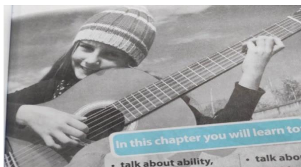
Figure 4. 1 A Girl Playing Guitar

After going through several stages of data analysis the results found are There are 29 pictures of women in the book English on Sky 2 which represent the roles of women based on Peterson's (2004) opinion. The results found were from 4 types of Peterson's theory which said the concept of the role of women in the new era, namely :