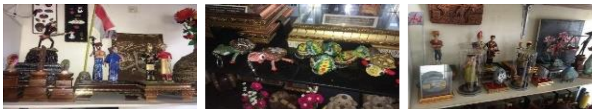
Figure 1. Products Produced by Partners.

Every month, partners are able to produce as many as 20-50 sets of miniature custom clothing, 50-100 key chains and fridge magnets, and 1-2 wall paintings. Price ranges for miniature custom clothing ranging from Rp.250,000, - Rp.600,000, key chains and magnets starting from Rp.5,000, - Rp.10,000, and paintings starting from Rp. 200,000 - Rp.500,000. Some of the products made by partners can be seen in the picture below.