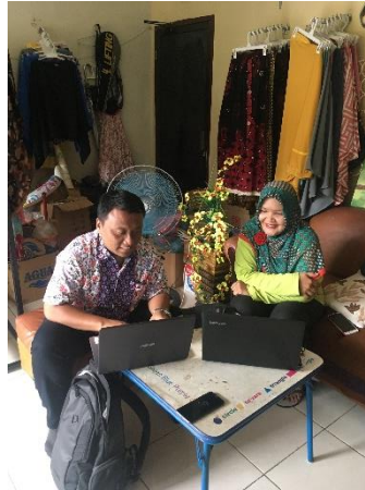
Figure 3. Management and Financial Assistance Activities.