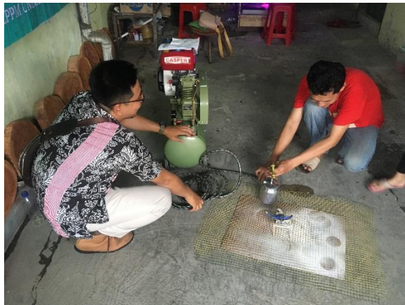
Figure 4. Provision of ATTG and Utilization Training.