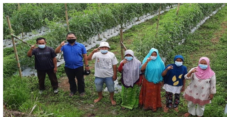
Figure 2. Documentation of PKM activities