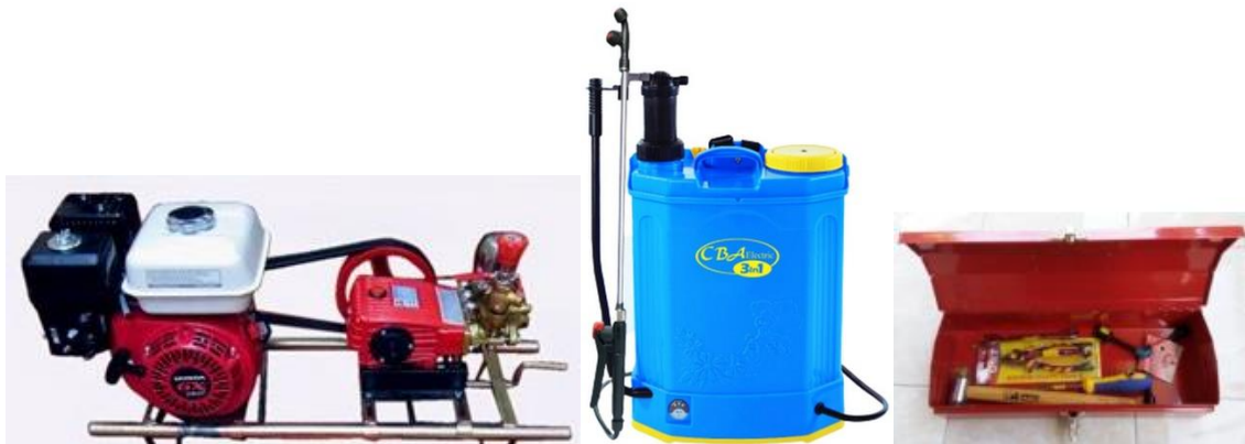
Figure 1. Types of equipment and materials for PKM

In the early stages, members of the farmer group obtain materials related to applying appropriate technology for agriculture. Bakti Dwi Waluyo carried out the delivery of this material. In the next stage, members of the farmer group received counseling related to the use and maintenance of automatic sprayers delivered by Eka Dodi Suryanto. After all the materials are explained, the next stage of implementation is using and maintaining automatic sprayers. At this stage, students are involved in assisting in the use and maintenance of automatic sprayers.