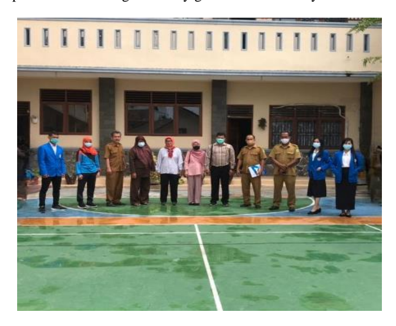
Fig. 3. Closing activity with Principal and participants

The closing activity was filled with hospitality and impressions as well as suggestions from participants during this community service activity to improve the next activity. The Organizing Committee and Presenters motivate the participants to continue learning and improve their competence, both individually and groups. It was expected that schools, especially teachers can implement and improve the knowledge that they got from this activity.