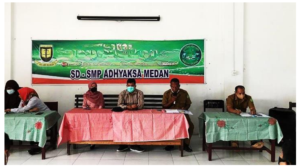
Fig. 1. Opening Socialization JCRS (Journal of Community Research and Service), 6(1), 2022

There were 3 steps in implementing the socialization in SD Adhyaksa Medan. This service activity was started by preparation of activities in which participant forms to partner teachers and socialization activities were distributed. The purpose of this activity is to provide information on the agenda of activities, the objectives of implementing the activities and seeking agreement on the schedule. The socialization was attended by 20 (twenty) teachers. The activity was opened by the Principal and the Implementing Committee. It also carried out the submission of practice questions along with discussions that were practiced during socialization.