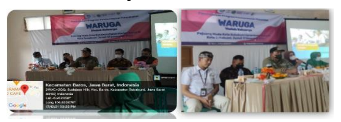
Figure 2. Speeches in the Opening Session of the implementation of Social Entrepreneurship Training activities of Pejuang Muda of Sukabumi City

The speakers also motivated the participants to be able to apply the results of the training in their real lives. Participants were expected to be more creative and took advantage of existing business opportunities as a result of the training activities.