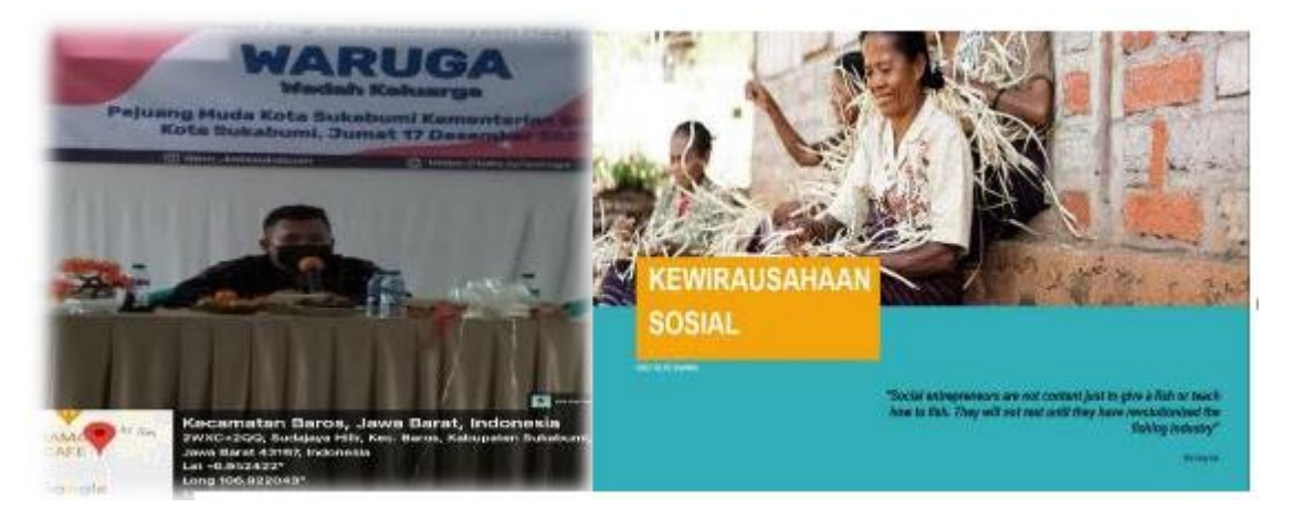
Gambar 3. The Presentation of Social Entrepreneurship

The speaker also explained about the goals of social entrepreneurship, the characteristics of social entrepreneurs, steps to build social entrepreneurship and examples of social entrepreneurship.