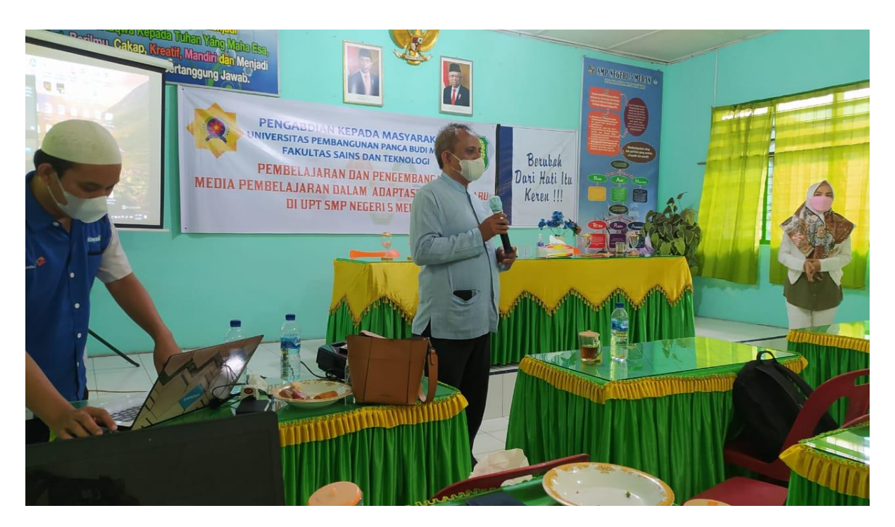
Fig. 2. PKM Activity Team is Presenting Material.

Blended learning is a learning method that combines two learning patterns, namely by utilizing technology and learning through teaching staff. It can be concluded that the pattern in the blended learning method concept uses a combination of conventional methods and utilizes the development of information technology. From the concept of mixing patterns in the learning method is the mixing of learning that is carried out conventionally with online classes which are expected by all students to be able to be active by finding a way of learning that suits themselves, and the teacher plays a role in making the classroom atmosphere orderly, not boring, and empowering students to establish an activity that builds facilities and infrastructure in knowledge for each student. With the blended learning method, it can increase the quality and capacity of the amount in learning, because of the combination of technology and human interaction so as to develop learning [7].