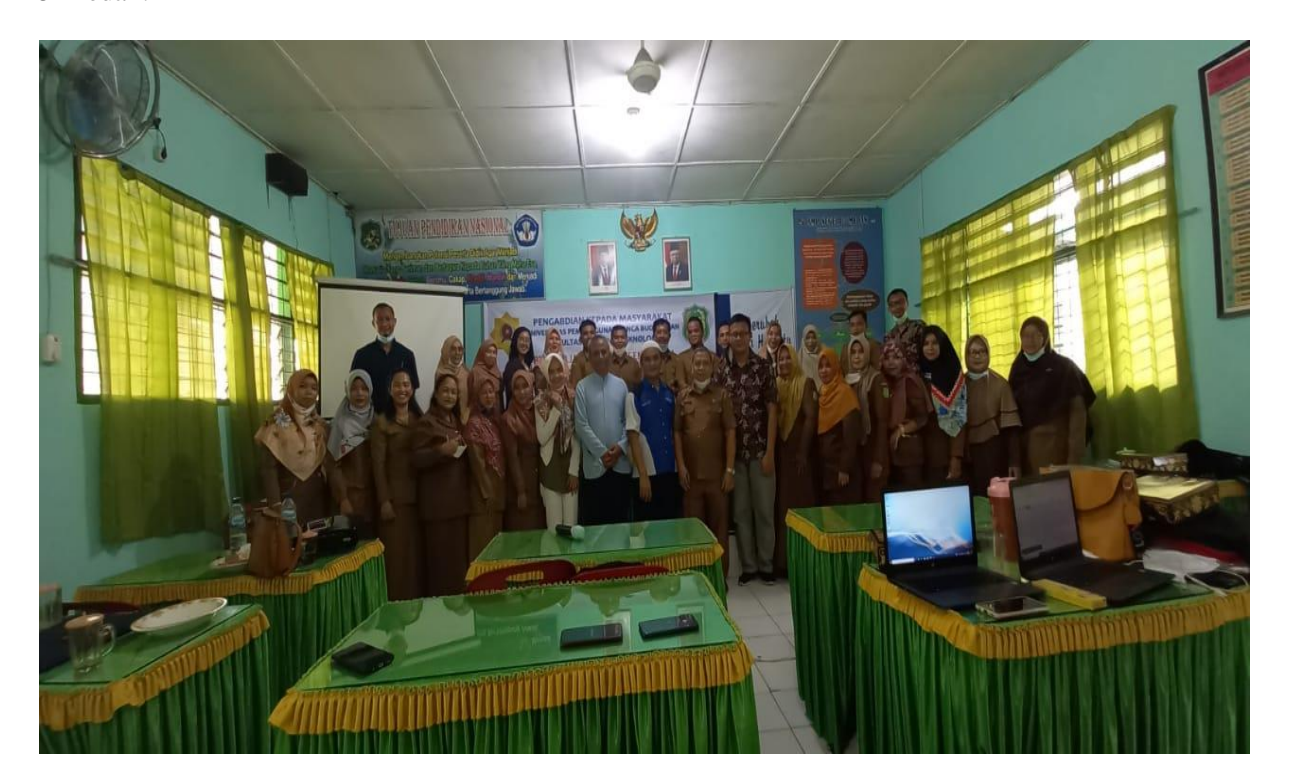
Fig. 3. Photos with the Team and Activity Participants.

After the material was delivered by the team, the participants were also taught to use IT better. Even though during the Covid-19 Pandemic, teachers teach with an online system and there is nothing wrong with this training, they are still trained in the use of IT. After the Covid-19 Pandemic and many teachers have done face-to-face learning but do not turn their backs on technology, in fact technology must be further improved. The Government's policies on learning make all Teachers hone their skills at all times so as not to be left behind. The participants were even more enthusiastic when the training was carried out using IT, and it was also seen that the participants were preparing their media in the form of laptops and smartphones. At the end of the session, the participants were given the opportunity to ask questions and answers about activities and learning activities that were carried out after the Covid-19 Pandemic. After the question and answer session was carried out, the activity was completed. The community service activity team evaluated by communicating to the School about how teachers would improve their performance after this training activity and a photo was taken with the activity team with all participants who were teachers at SMP Negeri 15 Medan.