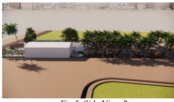
Fig 5. Side View 2