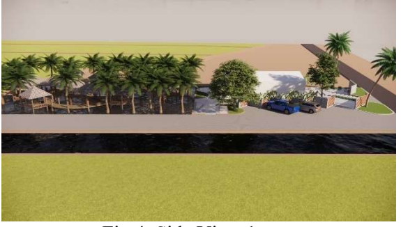
Fig 4. Side View 1