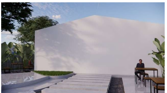
Fig 9. Dine Area 1