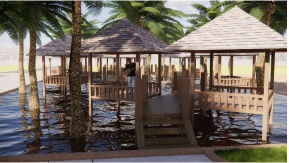
Fig 13. Floating Restaurant 2

The inventory analysis revealed that the research site is predominantly characterized by paddy fields, which provide a scenic backdrop for culinary tourism activities. The physical and environmental aspects of the paddy field area were assessed, considering factors such as topography, vegetation, and accessibility.