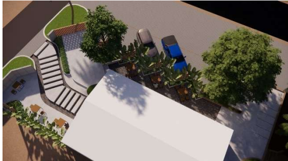
Fig 6. Top View