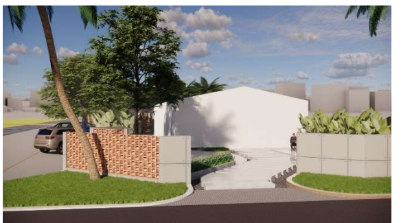
Fig 8. Front Side