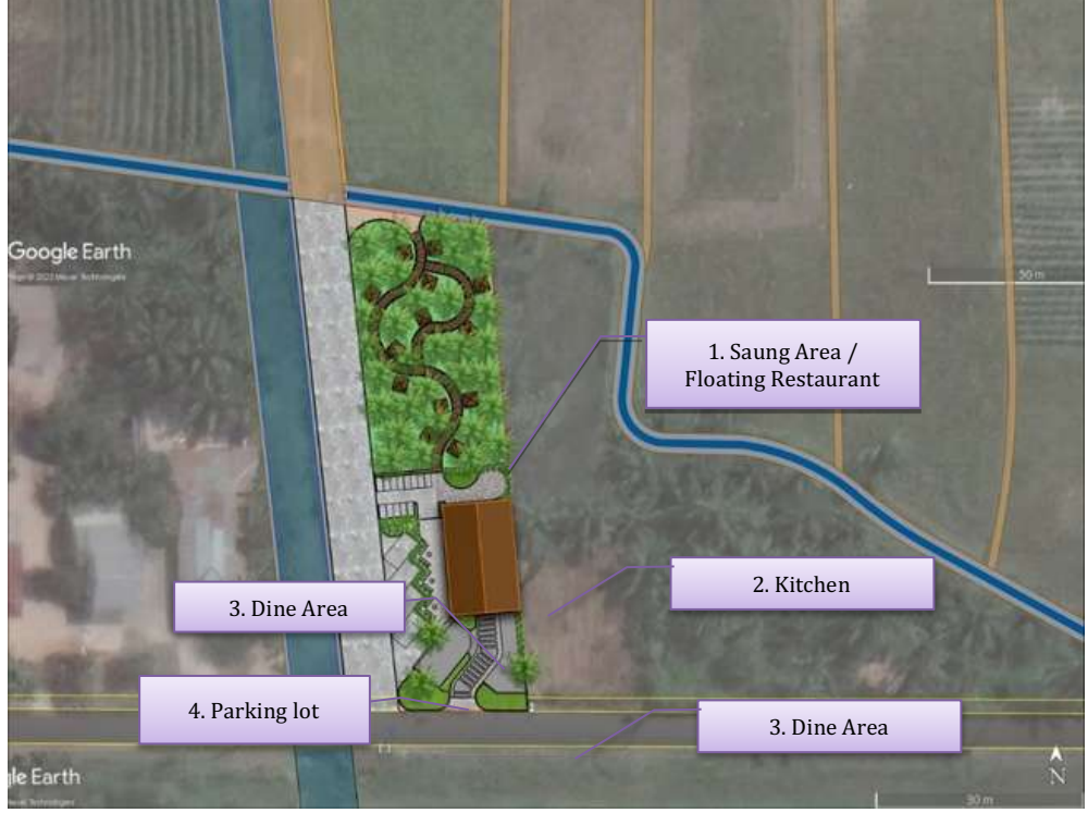
Fig 3. Site Plan

The picture above is a site plan for theculinary attraction at Paddy Field.