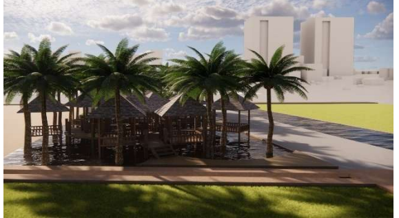
Fig 12. Floating Restaurant 1