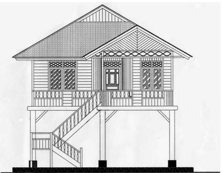
Fig 2. Malay stilt house