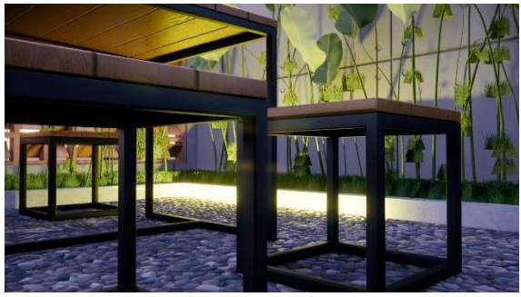
Fig 10. Dining Chairs