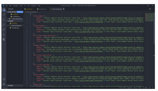
Fig 1. Program code in the data_place.json file

By creating the content and application design, the preparatory stage for conducting Chatbot prototype training sessions has completed. This phase involves setting up service locations, creating administrative and transportation arrangements, manufacturing procedures, and presenting any necessary application features. At this point, the coding procedure also gets carried out in accordance with the created design. Figure 1 shows a coding display.