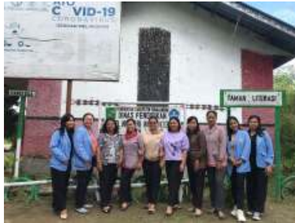
Figure 1: Activities at SDN 091333 Raya Usang.

prepared according to their needs. The community service team also evaluates the team's performance in delivering training to teachers.