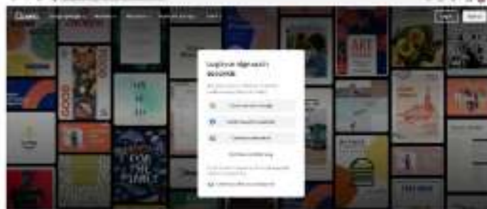
Figure 3. Page for logging in and registering on Canva Magic AI