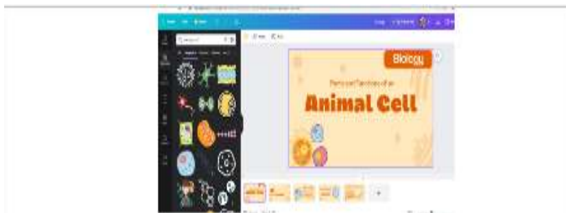
Figure 5. Display of the Teaching Media Editing Process