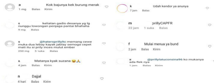
Picture 2 Harassment Cyberbullying

These three comments were really sensitive and hurt the the people’s feeling when reading it. people must be able to think about the feelings of others when giving some comments.