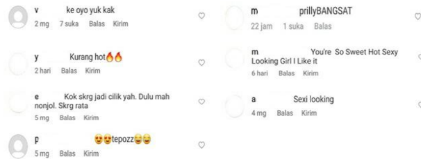
Picture 1 Flaming Cyberbullying

The netizens created negative comments in Indonesian female artist's account that can be seen from the data below: