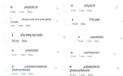
Picture 3 Denigration Cyberbullying

The comments above were included in the category of harassment cyberbullying because there was a user who continues to comment on Prilly's account with identical meanings but in different sentences. A comment can be said to be harassment because it occurs continuously. Several other users put bad comments to Prilly, but not repeatedly. In the first comment, @a***** she stated “kok bajunya kek burung merak”. Practically, this comment did not really bully Prilly because @a***** only commented on the clothes that Prilly was wearing. However, this comment was considered as a bullying action because Prilly’s clothes did not look like a peacoc at all and looked very elegant. Her clothes were designed from other designer so that bullying was not given to Prilly but rather to the designer who design the clothes.