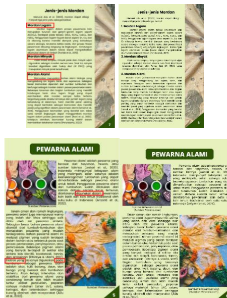
Figure 5. Revision of language aspect feasibility assessment

In terms of language, the assessment of the feasibility of Green Chemistry e-supplements is carried out through a number of indicators, one of which is straightforward. In the analysis, there are several sentences in the e-supplement that are considered less effective, as shown in Figure 5 below.