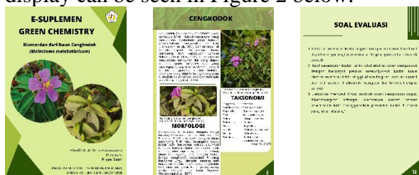
Figure 2. Display of green chemistry e-supplement

The next stage in this research is development, namely making learning media in accordance with the plans that have been made previously. Learning media made in the form of A4-sized e-supplements designed using Canva through the website. The e-supplement contains cengkodok plants ( M. malabathricum ), synthetic dyes, natural dyes, mordants, determination of cengkodok leaf levels, application of biomordants from plants, and evaluation questions to increase students' understanding. This learning media is expected to help students develop skills in utilizing local plants. The e-supplement display can be seen in Figure 2 below.