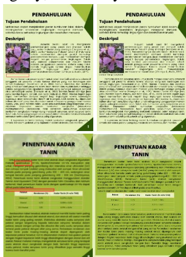
Figure 4. Revision of media aspect feasibility assessment

sub-material types of mordants (Figure 4). In addition, each image also needs to include the source of the image to ensure the validity of the image used in the e-supplement. Then the addition of numbering to the types of mordants, namely metal mordants, oil mordants, and natural mordants, aims to provide clarity and order of explanation in the content of e-supplements so that improvements are needed to produce effective sentences. This is in accordance with the view of Indrastuti (2020), straightforward language is characterized by effectiveness, unambiguity, and clarity.