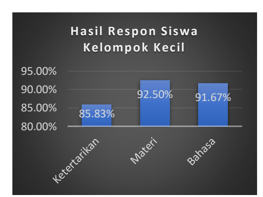
Figure 5. Small Group Student Response Results

Small group trials were conducted to determine the feasibility of the developed LKPD, this trial involved 10 students who were randomly selected. In this trial, the revised LKPD was distributed, then students used the LKPD. After students finished using the LKPD, students were given a student response questionnaire consisting of 15 assessment items. The results of student responses can be seen in the figure below.