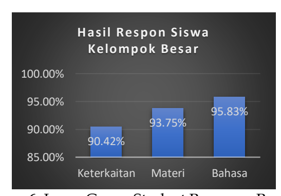
Figure 6. Large Group Student Response Results

The student response questionnaire in the large group consisted of three aspects, namely interest, material and language. The results obtained from the questionnaire received a fairly high score, including the interest aspect of 90.42%, the material aspect of 93.75%, and the language aspect of 95.83%. The average percentage on the results of small group student responses scored 93.33% so that the LKPD can be classified into very practical. The results of student responses can be seen in the figure below.