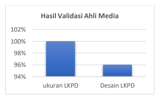
Figure 3: Media Expert Validation Results

One type of validation to determine the media validity of the LKPD that has been made is media validation, the results obtained from this validation are assessments, suggestions and also comments on the products produced which are useful for improving the quality and feasibility of the product.