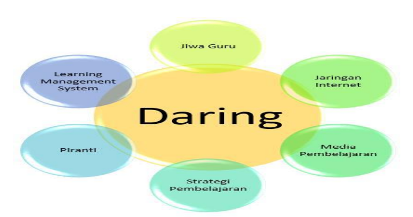
Figure 1. The Concept of Online Success in the Pandemic

Based on the data above, it can be concluded that the role of pedagogic competencies that junior high school teachers have is very large in creating effective learning. This can be seen from the efforts of teachers in improving the quality of class management ranging from planning, implementation and evaluation. it refers to the opinion of Dego &Kerebungu, (2019) that the pedagogical competence of a penjas teacher can be seen while the teacher is able to design and carry out learning, understand the character of learners, and be able to evaluate learning outcomes. Therefore, what has been done by the above teachers is a reflection of a teacher who has and is able to apply the value of pedagogic competence.