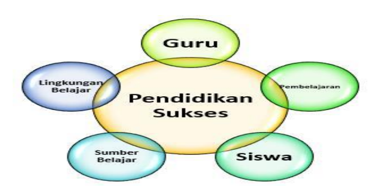
Figure 2. Learning System

Teacher Pjok, as a facilitator and motivator. Learning, interaction focuses on the method of inquiry and discovery. Students, show creative work. learning resources, multi-dimensional. learning environment, planned, unplanned and contextual.