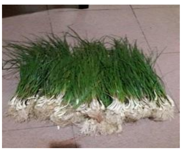
Fig 1. Batak onion plants (Allium chinense G. Don)

researchers wanted to remove these leeks was because in addition to the typical North Sumatra plant, research on these onions still needed to be developed given the enormous benefits of these onions (Aretha and Jusuf, 2019).