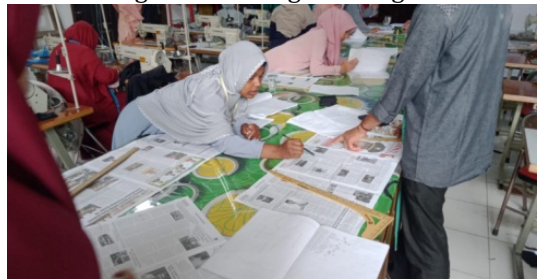
Figure 1. Sewing Training