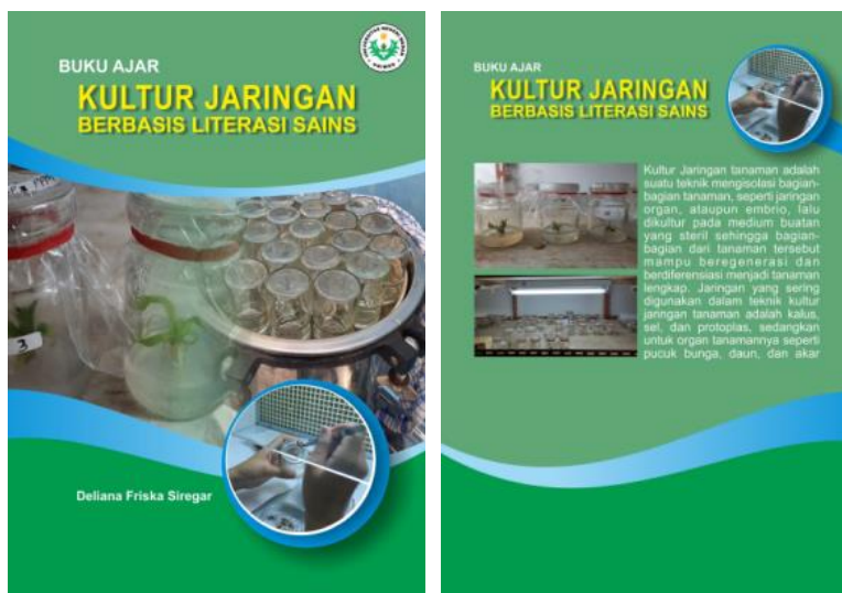
Figure 1. Front cover and back cover of the textbook

The application of these four concepts has a relationship with inquiry learning strategies. The opinion of Rakhmawan, et al., (2015) , which says that the inquiry learning approach can create the attitude of a scientist in students who always try to understand natural conditions as applied science and inform the description of things they find in real life.