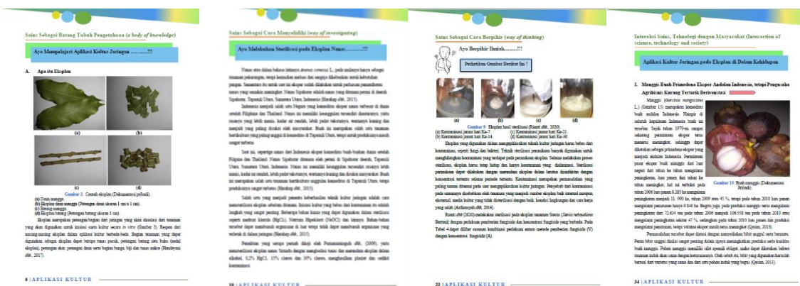
Figure 2. Sample content of the developed tissue culture textbook. The book's contents describe four concepts of scientific literacy: 1) Science as a body; 2) Science as a way of investigating; 3) Science as a way of thinking and 4) Interaction of science, environment, technology, and society.