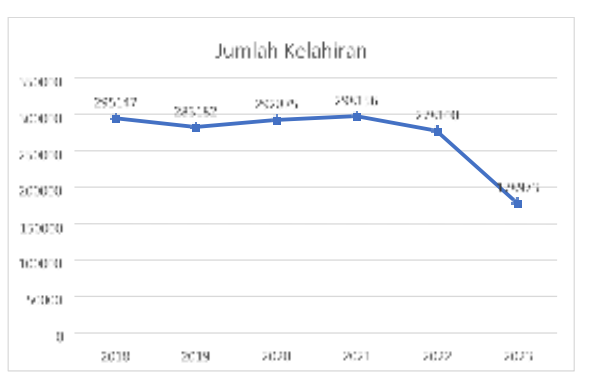
Figure 2. Number of baby births in North Sumatra

The trend of delaying first marriage is a social phenomenon where individuals delay the age of their first marriage to an older age than previous generations. In the context of fertility, this trend has significant implications. Delaying the age of first marriage could potentially lead to a decline in fertility rates, as age is an important factor in women's reproductive quality. The older a person is, the lower the likelihood of having children, and the higher the risk of pregnancy and birth complications. In addition, delaying first marriage can also change reproductive patterns, with smaller families or even no children at all. This can impact the demographic structure of a population, with the potential to lower population growth rates.