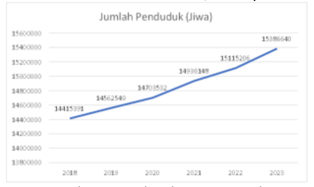
Figure 3. Population Growth in the Province North Sumatra

Conversely, low fertility will result in fewer births, which can lead to a slowdown in population growth or even a decline in population in the long run. The following is the development of population in North Sumatra Province, namely: