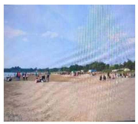
Figure 2.5 Supi beach

Supi beach helps improve their family's economy, creates jobs and is also a place to rent equipment for the beach such as barges. or tires for swimming.