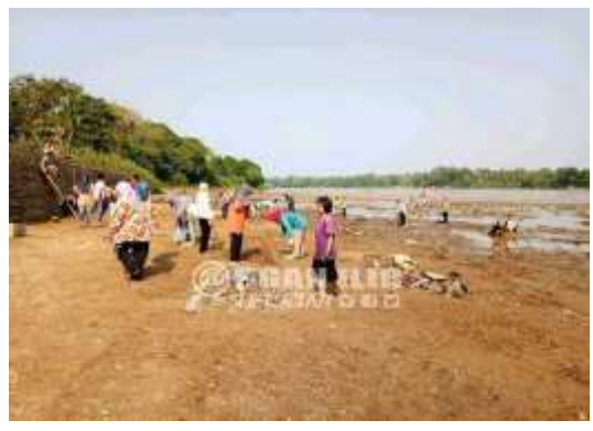
Figure 2.6 Mutual cooperation

From the results of interviews, the Sungai Pinang community held mutual cooperation to clean Supi beach from rubbish and dirt. This was carried out periodically to ensure that Supi beach remained clean to maintain the comfort of tourists and several communities formed waste management teams to collect rubbish in a more organized manner.