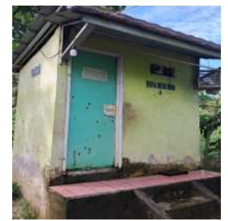
Figure 2.3 Supi beach