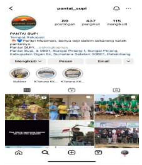
Figure 2.7 Social media

Promotion of Supi Beach is via social media and the promotion is very effective and connected to the audience provided by Instagram and Facebook.