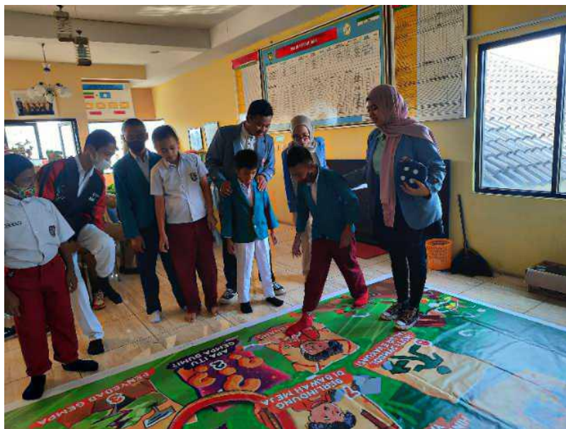
Figure 4. Fun process of disaster mitigation games

is a Montessori approach. In this activity, students can engage in dice-throwing activities and child-centred learning (Wulandari et al., 2018). The teacher provides evaluations and conclusions regarding the earthquake disaster mitigation fun game, which is included in the high-scope approach. In this section, students develop problem-solving, interpersonal and communication skills (Rohmah N et al. 2019).