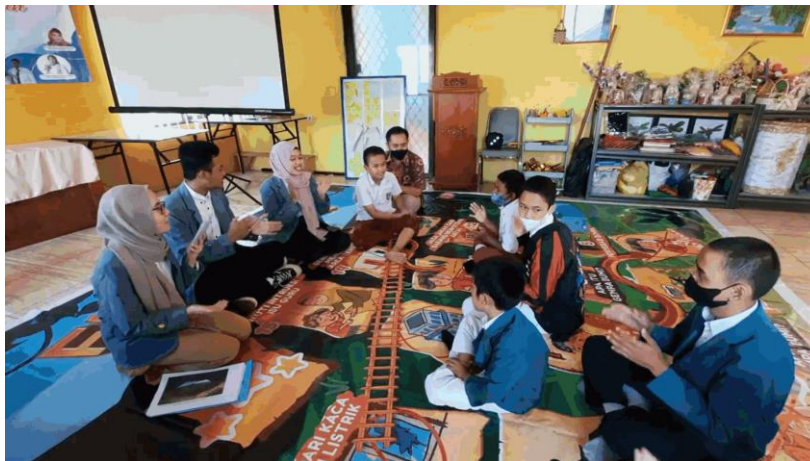
Figure 2. Earthquake disaster mitigation education

was in the range of 51% - 75%. Conceptually, students' knowledge is slow in capturing a discussion, but in practice, students can follow it carefully so that the assessment develops as expected. Some students get different assessments, while students in the first cycle have an assessment of developing expectations. Only one assessment began to develop, namely knowledge related to the Lembang fault