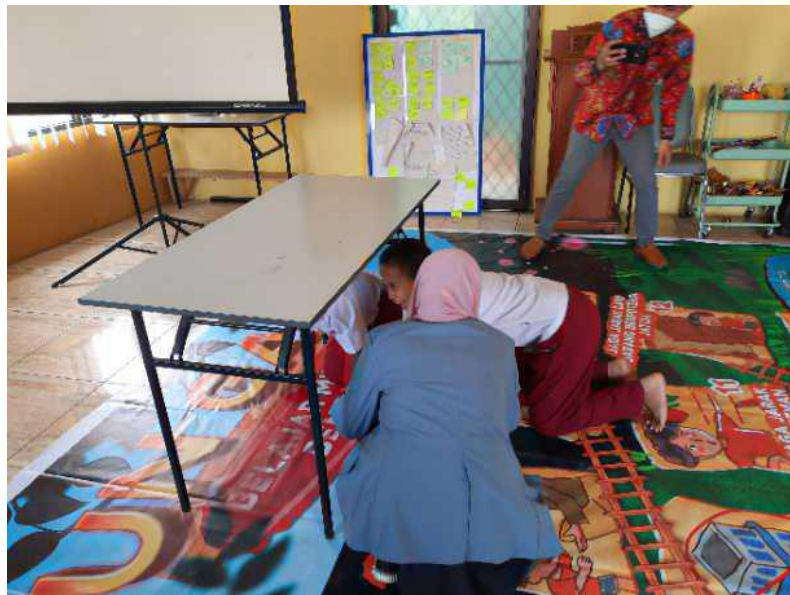
Figure 3. Simulation of shelter during an earthquake

The concept of mitigation and the Lembang fault area has not been able to develop as expected; students only know and cannot describe according to development achievements. Still, students know what to do when an earthquake